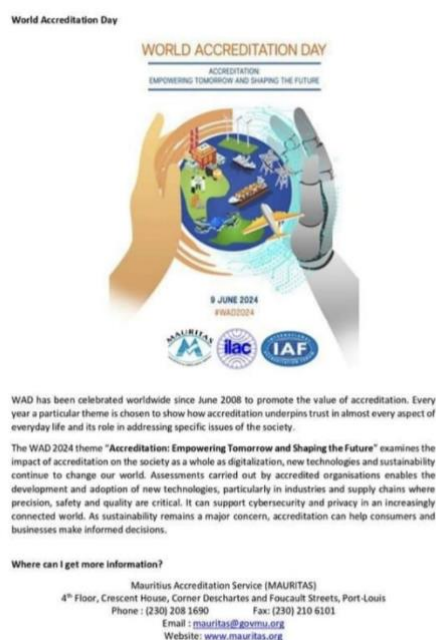
Article posted on the Government Information Service Facebook page