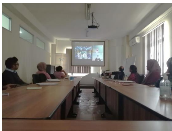
MAURITAS staff attending the online celebrations of ILAC/IAF

MAURITAS organized a virtual participation for all its staff in the WAD 2024 celebrations hosted by the International Laboratory Accreditation Cooperation (ILAC) and International Accreditation Forum (IAF) on Monday 10 June 2024 at 13hr00 (Mauritian time). All stakeholders were also invited to attend the celebrations online.