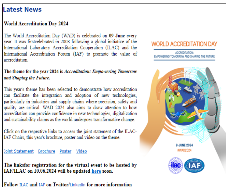
Article posted on the MAURITAS website

MAURITAS also reinforced its online presence by publishing an article on its website ( www.mauritas.org ) to serve as a go-to guide for visitors seeking in-depth knowledge about accreditation's far-reaching benefits. The joint statement issued by ILAC and the IAF, together with the brochure and poster promoting this year's theme were also circulated to all relevant stakeholders, committee members as well as public officers.